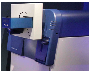
Figure 1 LDTD interfaced to AB SCIEX TripleTOF™ 5600 System